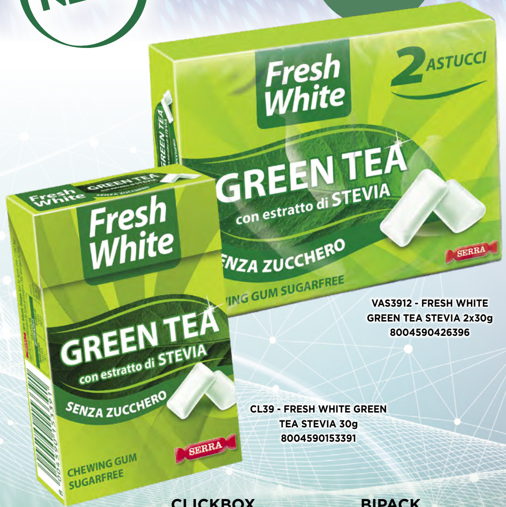
VAS3912 - FRESH WHITE GREEN TEA STEVIA 2x30g 8004590426396