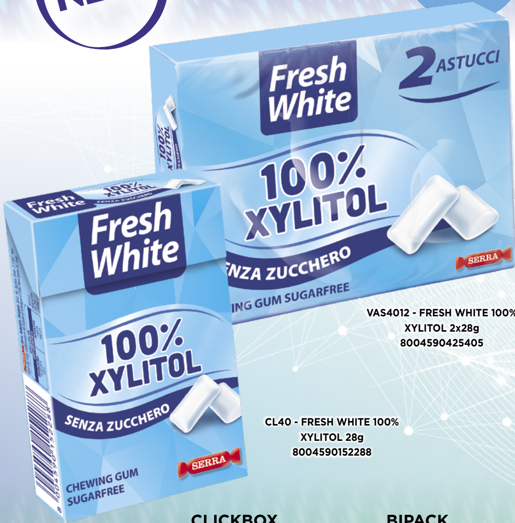
VAS4012 - FRESH WHITE 100% XYLITOL 2x28g 8004590425405